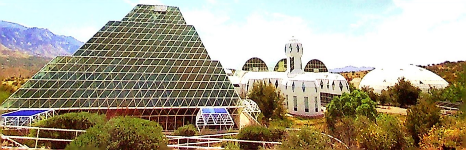
Photo: Biosphere2, Oracle, Arizona